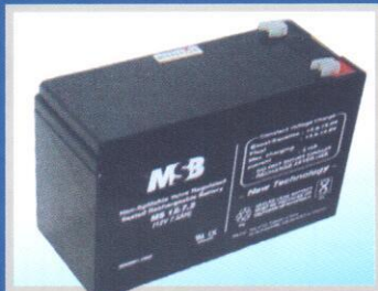
Pro 9 Rechargeable Battery 12V